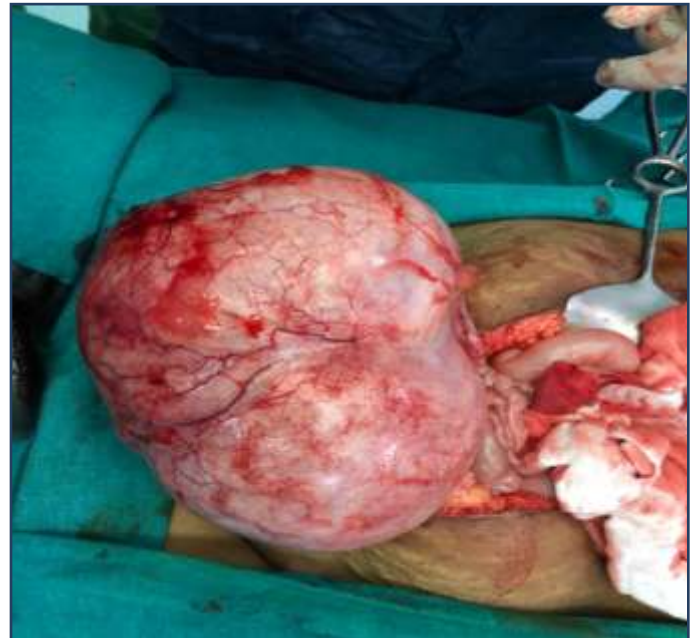
Figure/ Picture : 04