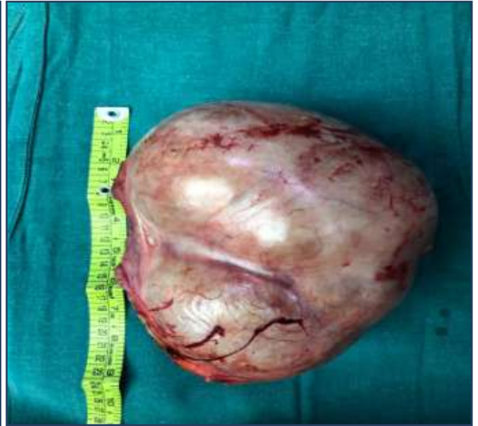
Figure/ Picture : 01 Figure/ Picture : 02