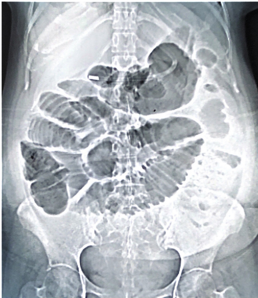
Fig. 1. Simple abdominal radiograph showing signs suggestive of intestinal obstruction.